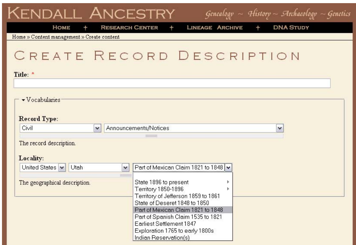
FIGURE 2 - THE LOCALITY VOCABULARY

Since there are 18 record categories defined in the Record Type vocabulary, manually maintaining hierarchical links among the research reports as new ones are added would be intractable. Our implementation, however, automatically maintains these links and allows research reports to be added with a singular interface similar to the Record Repository , regardless of where the report ends up in the hierarchy. This is accomplished through a set of queries embedded into a single page, taking context from the URL.